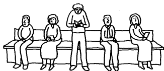
SEE WHETHER IT SAYS ANYTHING IN THE SERVICE BOOK