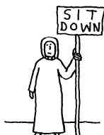
LOOK OUT FOR SUBTLE HINTS GIVEN BY THE CLERGY